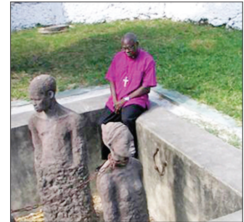
At memorial in a former Zanzibar slave market, Archbishop of York John Sentamu reflects on suffering. Zanzibar's Anglican cathedral now stands on site of slave market, its altar marking former whipping post.