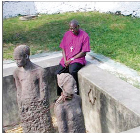
At memorial in a former Zanzibar slave market, Archbishop of York John Sentamu reflects on suffering. Zanzibar's Anglican cathedral now stands on site of slave market, its altar marking former whipping post.