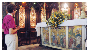
In Zanzibar cathedral, Presiding Bishop Katharine Jefferts Schori views altar above former slave market whipping post.

Meanwhile the General Convention has called the Episcopal Church to confront its own history concerning slavery. (GC Resolution A123, A124, C011 and C040, http://www.episcopalchurch.org/gc.htm )