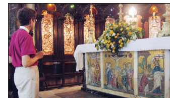
In Zanzibar cathedral, Presiding Bishop Katharine Jefferts Schori views altar above former slave market whipping post.

Meanwhile the General Convention has called the Episcopal Church to confront its own history concerning slavery. (GC Resolution A123, A124, C011 and C040, http://www.episcopalchurch.org/gc.htm )