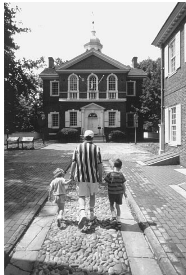
The First Continental Congress met at Carpenters' Hall in 1774. Early tools and original chairs are on display.

To get to Independence National Historical Park, walk east from the convention center on Arch Street to Third Street and turn right (south). Walk three blocks to the visitor's center. For further information, call 597-8974.