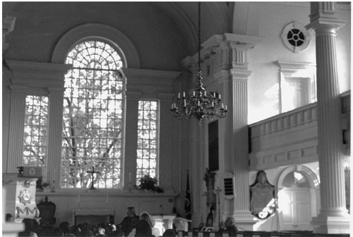
Above, the interior of Christ Church today. At right, a sketch of the Church constructed from 1727 to 1744.

A history, "Christ Church, Philadelphia: The Nation's Church in a Changing City," published by University of Pennsylvania Press, 1995, is available for $15 at the Christ Church bookstore.