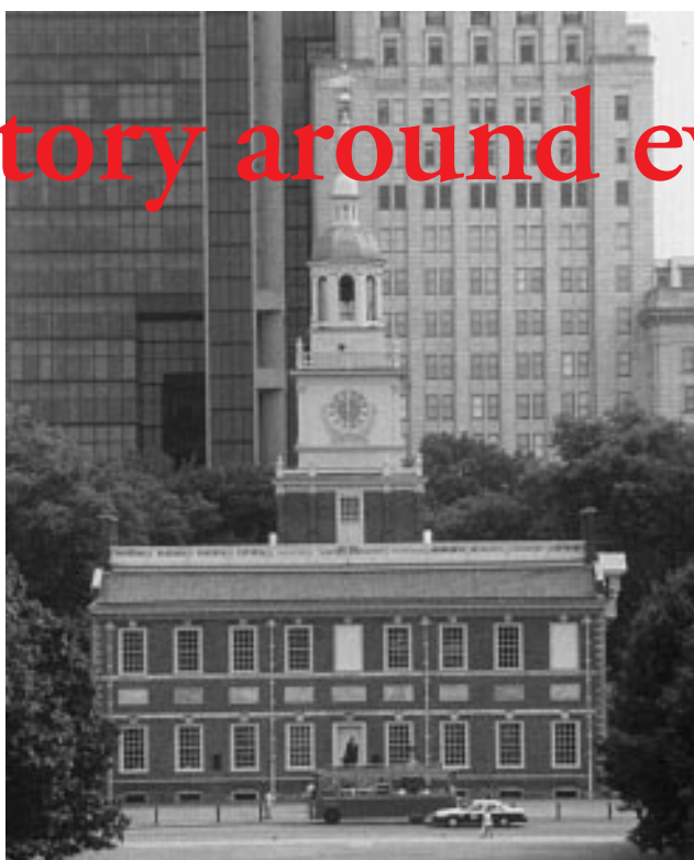
Independence Hall is the birthplace of the nation and the site of the first organizing meeting of the Episcopal Church in 1789.

Across Market Street and to the left from Franklin Court is cobble-stoned Church Street and the 18th-