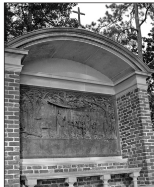
Robert Hunt Shrine, Jamestown

A stone memorial shrine, given by the Colonial Dames of America in the State of Virginia, honors Hunt and his ministry of planting the first Protestant congregation in America. Highly esteemed and accustomed to hardship, the pioneering priest was beset with illness on the voyage, and all his books and other possessions burned in the Jamestown Fort fire of 1608.