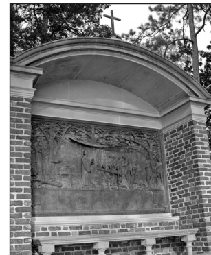
Robert Hunt Shrine, Jamestown

A stone memorial shrine, given by the Colonial Dames of America in the State of Virginia, honors Hunt and his ministry of planting the first Protestant congregation in America. Highly esteemed and accustomed to hardship, the pioneering priest was beset with illness on the voyage, and all his books and other possessions burned in the Jamestown Fort fire of 1608.